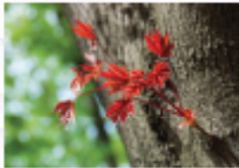
Red Maple bark (Also Sweetgum and Red Cedar bark)