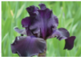
Dark varieties of fresh or dried Iris blossoms