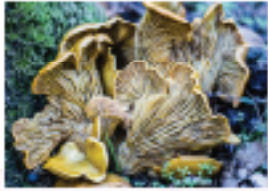
Western Jack O'Lantern mushroom