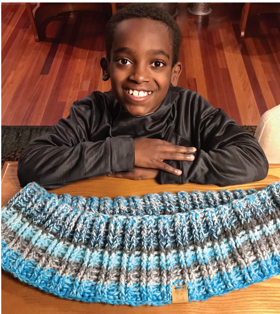
This versatile cowl is made using "cake" yarn and can be worn by both men and women.